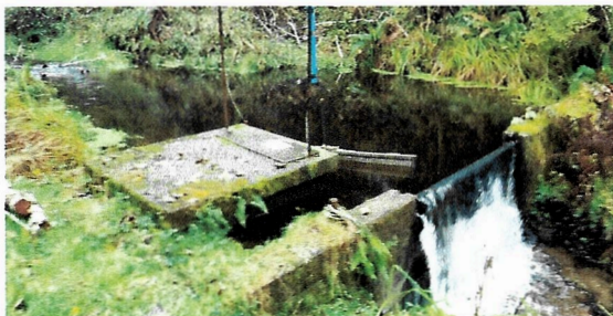
Fat Buck Creek

PPM, PPB and MGL: (Parts Per Million, Parts Per Billion, and Milligrams Per Liter) These units of measurement describe the levels of detected contaminants. One part per million is equal to one minute in two years.